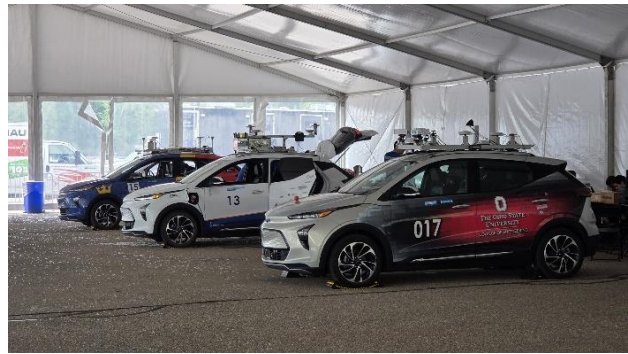
AutoDrive Challenge™ II

AutoDrive Challenge™ II is a contest for university students that aims to train next-generation automobile engineers. The participating teams develop autonomous driving systems for vehicles using components compliant with the standards provided by SAE, taking on various challenges along the way. The Dynamic Map Platform Group has been providing the 3D data used in the contest as an official supplier for four consecutive years since the event was first held in 2022.